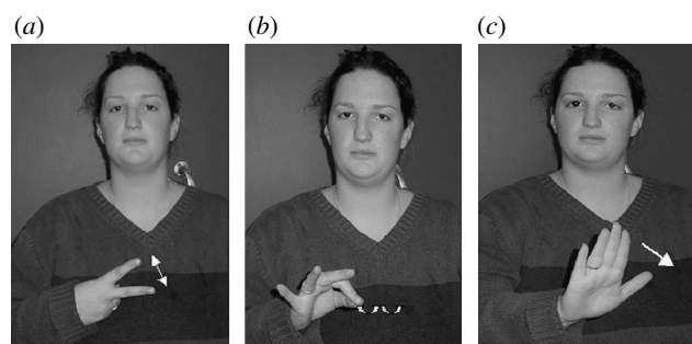
Figure 1. Illustration of three BSL signs used in experiment 1: (a) SCISSORS; (b) SEWING; (c) PUSHING. Arrows indicate direction of movement.

corresponding actions (see figure 1). No such difference is present for the English words, as none of the wordforms used in these semantic classes are iconically linked to their referents. In Experiment 1 we compared similarity judgements of BSL signers and English speakers for translation-equivalent signs/words from these semantic classes, in order to test whether language-specific effects stemming from visual motivation of BSL signforms could be observed.